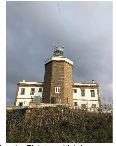
One of the antennas installed at the Finisterre Lighthouse